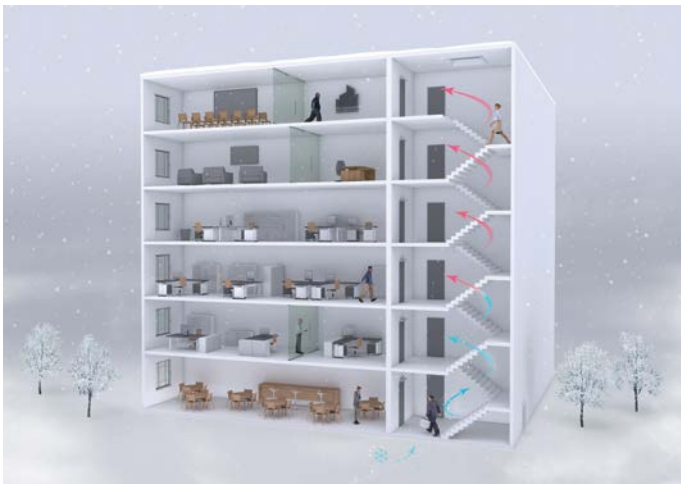
ED 100/250 with SPV flexibly adapt to the seasons.

WN XXXXXXXXXXXX, DE, 01/2023 | Subject to technical modifications