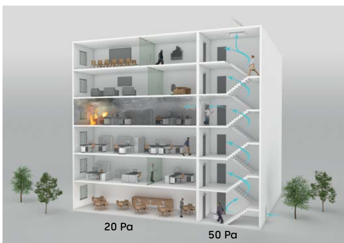
The ED 100/250 with SPV is strong when it counts.